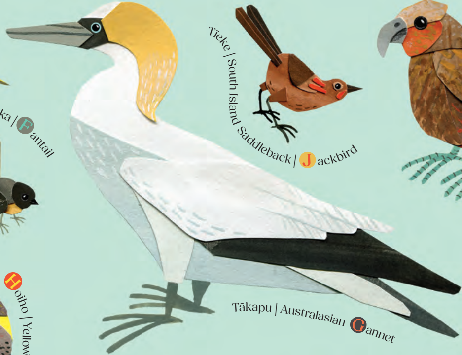
Tākapu | Australasian G annet