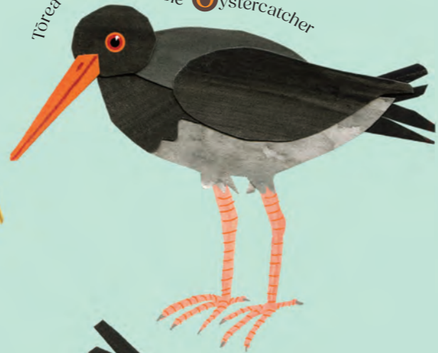
Tōrea Pango | Variable O ystrercatcher