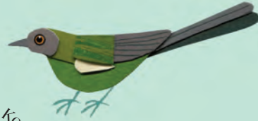
Korimako | B ellbird