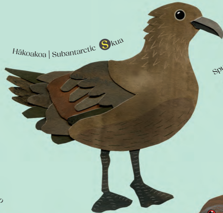
Hākoako | Subantarctic S kua