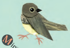
M iromiro | Tomtit