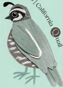
Tikaokao | California Q uail