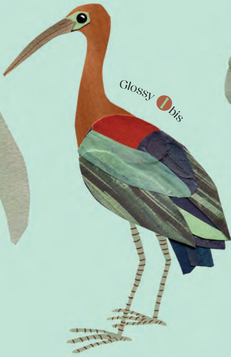
Glossy D ibis