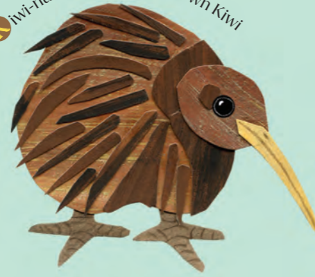
K īwi-nui | North Island Brown Kiwi