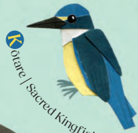
K ōtare | Sacred Kingfisher