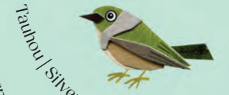
Tauhou | Silvereye ( Z osterops lateralis)