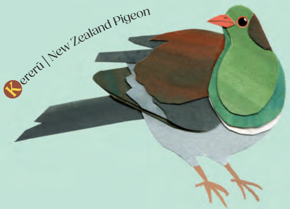
K ererū | New Zealand Pigeon