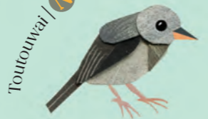
Toutoutai | N orth Island Robin