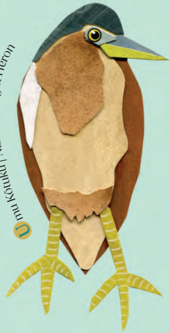
Maukōtuku | Nankeen Night Heron