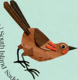
Tieke | South Island Saddleback | J ackbird