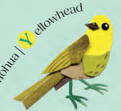
Mohua | Y ellowhead