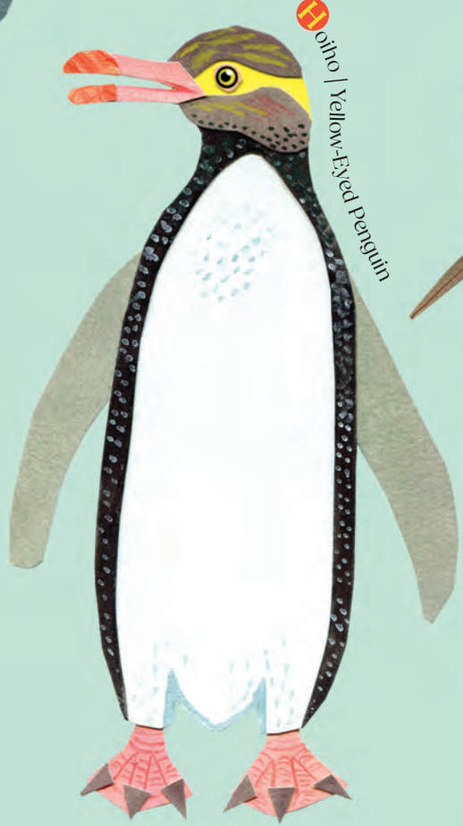
Hoiho | Yellow-Eyed Penguin