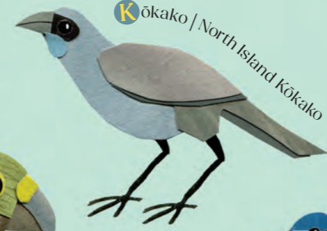
K ōkako | North Island Kōkako