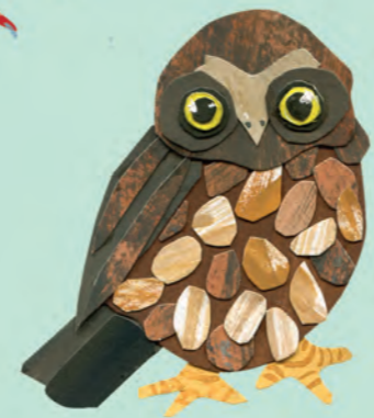
R uru | Morepork