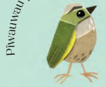
Pīwauwau | Rock Wren ( X enicus gilviventris)