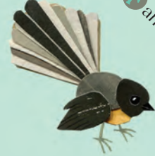
Pīwakawaka | F antail