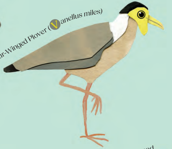
Spur-winged Plover ( V anellus miles)