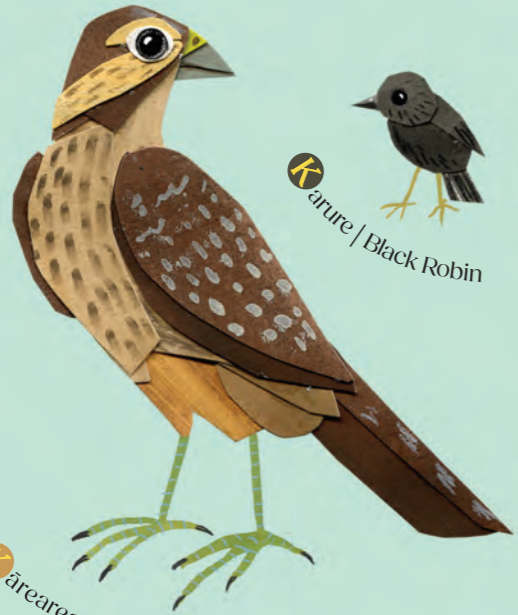
K ārearea | New Zealand Falcon