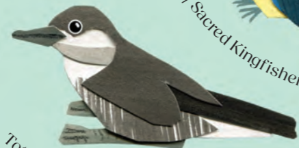
Totorore | L ittle Shearwater