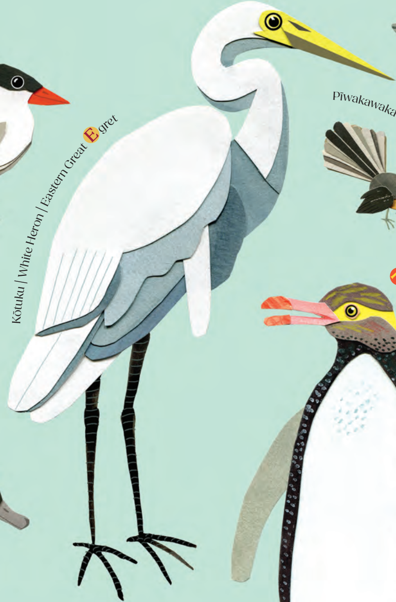
Kōtuku | White Heron | Eastern Great E gret