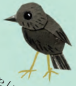
K āre | Black Robin